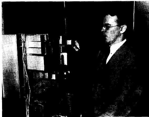
Harold S. Black in 1941 with some of the amplifying equipment that used his idea for reducing distortion by reversing some of the amplifier's output and feeding it back into the input.

Although not based on negative feedback, this amplifier was an essential step to its invention because Black had reformulated the problem. He was no longer trying to prevent vacuum tubes from causing distortion. He accepted that distortion and