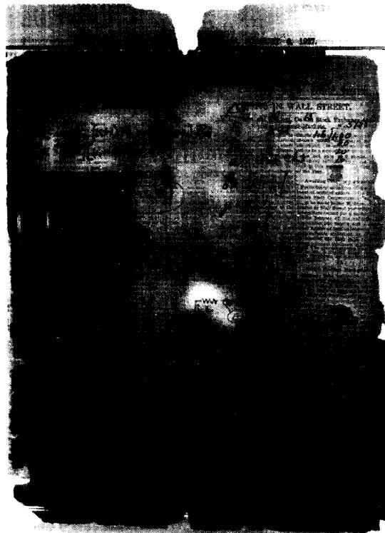
One of the newspaper pages used by Black to jot down his early ideas on feedback.

Negative feedback became widespread [2]. It allowed the Bell system to reduce overcrowding of lines and extend its long-distance network by